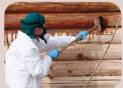
Immediately, vigorously back brush.