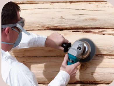
Osborn® Brush (Recommended method)

Once the logs are dry, hand finish the log surfaces to remove “felting” from power washing or to lessen the texture caused from media blasting.