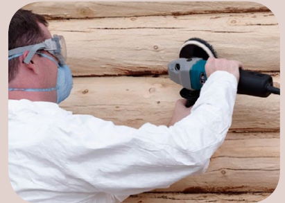
Sashco's Buffy Pad™ System or 3M® Non-woven Pad