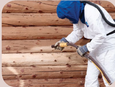
Corn Cob or Glass Blasting (Recommended method)

Prep the log surfaces using the method that will give you the finished appearance that you desire.