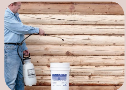
Apply Wood Preservative