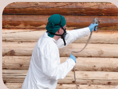
Spray on stain using a *Graco® 515 or 313 tip or equivalent.

Apply a borate wood preservative and insecticide, such as PeneTreat®, according to instructions.