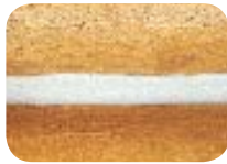
Log Jam® holds its seal.

You chose rugged, rustic logs and timbers to create your perfect home-stead. Now, use Log Jam® to protect it for years to come. Log Jam® is the industry standard in synthetic chinking. Unlike old-time mortar or other synthetic chinking, it holds tough year after year. Its superior elasticity means it moves with your logs without cracking to seal your log cabin from vermin, pollen, dust, rain and wind alike. You get the rustic look of old-time mortar without compromising modern-day comfort and energy efficiency. Keep the cozy feel and rustic look of big timbers without compromise. Seal your logs with Log Jam®.