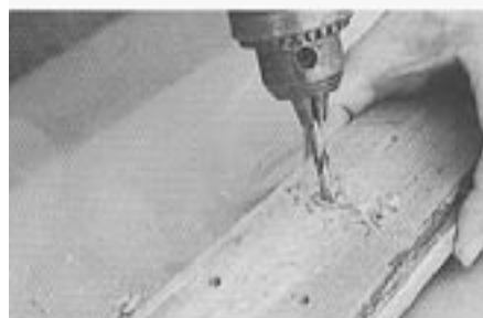
Drilling allows deeper penetration