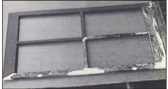
Half was left unpainted to show WoodEpoxy