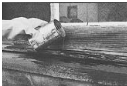
Pouring or brushing is sufficient where absorption is easy

TYPICAL APPLICATIONS: Rotted, dried-out or spongy windowsills - thresholds - window and door frames - columns - posts - stair steps - railings - balustrades - indoor and outdoor furniture - porches - gazebos - stages - platforms - balconies - countertops - cornices - capitals - entablatures - structural and decorative components - walls - mouldings - doors - shutters - artifacts - archeological and art restoration - protective impregnation.