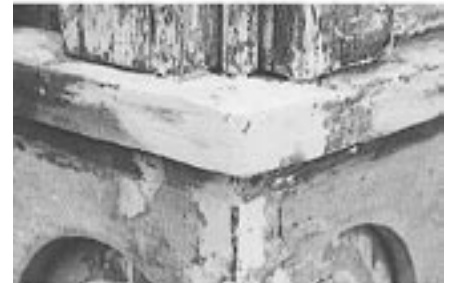
...can be easily and permanently restored...