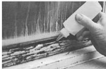
Squeeze bottles are excellent for injecting