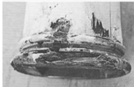
Only LiquidWood plus WoodEpoxy could save this column