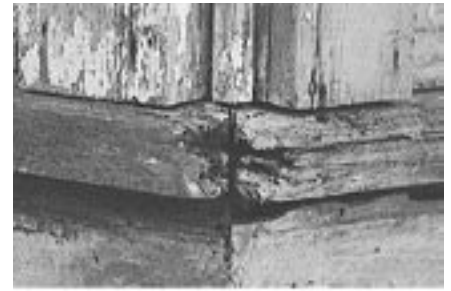
This rotted - and irreplaceable - woodwork...

TYPICAL APPLICATIONS: damaged, cracked or broken windowsills - thresholds - window and door frames - columns - posts - stair steps - railings - balustrades - indoor and outdoor furniture - porches - gazebos - stages - platforms - balconies - countertops - capitals - entablatures - structural and decorative components - walls - mouldings - doors - shutters - artifacts - archeological and art restoration - sculptures - protective filling and resurfacing - models - patterns - mock-ups - handles - knobs - all kinds of shapes.