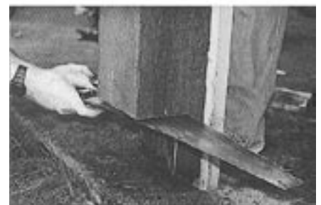
10" rotted bottoms of these load-bearing columns...