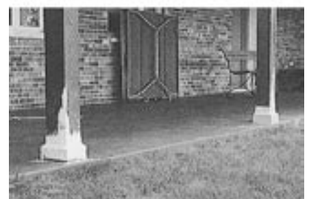
...WoodEpoxy, which outperforms and outlasts wood.