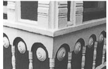
...sanded, nailed, stained, or painted.