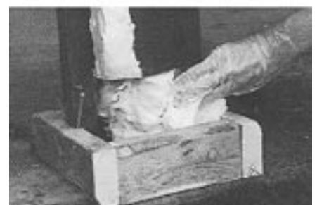
...were completely sawed off and replaced with...