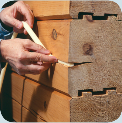
1 – Install backer rod into a clean, stained check to the appropriate depth. (See Fundamental Application Guidelines.)