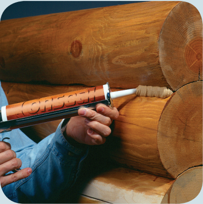
1 – Gun Conceal into clean, stained joints.