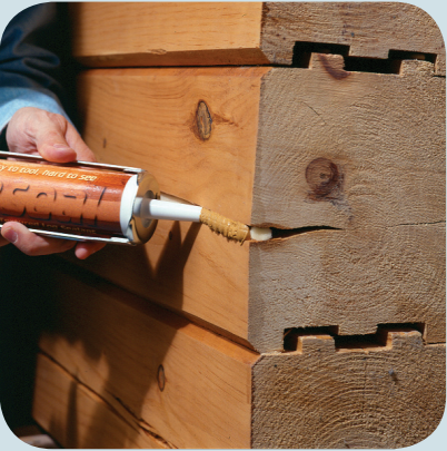
2 – Gun Conceal over the backer rod.