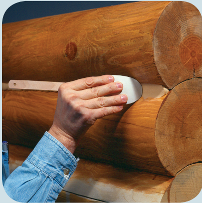
2 – Tool to ensure a tight seal to the top and bottom of the caulk line leaving at least 1/4” depth of caulk in the center of the joint.*