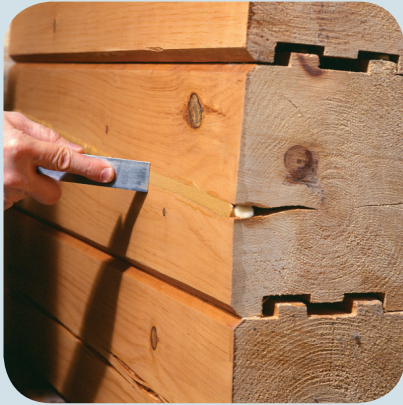
3 – Tool Conceal.