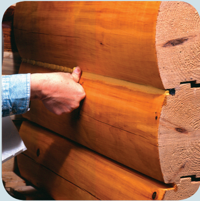
3 – Tool to ensure a tight seal to the top and bottom of the caulk line.