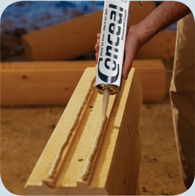
Apply bead(s) according to the log home manufacturer’s instructions. Stack the next log and repeat. Don’t allow caulk to skin over prior to stacking.