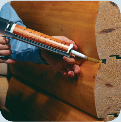
2 – Gun Conceal over the backer rod.