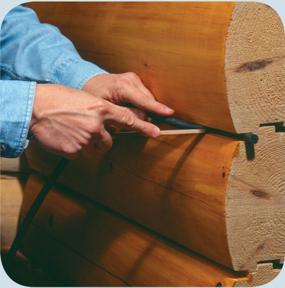
1 – Install backer rod into the caulk well of clean, stained logs.