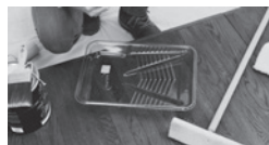
APPLY WITH A GOOD QUALITY BRUSH OR PAD APPLICATOR OR BY SPRAYING