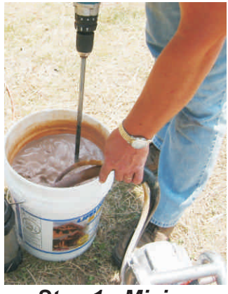
Step 1 - Mixing

When using pigmented stains we also recommend "boxing" containers to avoid any slight color differences as you go from container to container. The best way to do this is to mix up each pail then pour some LIFELINE from at least two pails into a separate container. As the working container gets low add additional LIFELINE but be sure to mix the pail again before pouring any stain from it.