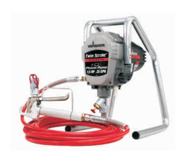
Wagner 9140S Airless Sprayer