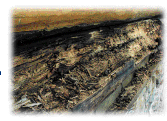
PeneTreat helps prevent damage before it starts.

PeneTreat can be applied by brushing, spraying, dipping, kerfflooding or hole flooding. It comes in powder form and just needs to be mixed with water for application. PeneTreat is packaged in two convenient sizes: 6-gallon pails that are easy to carry and double as a handy source for mixing the solution and the 3-1/2 gallon size—perfect for smaller jobs. The active ingredient in PeneTreat (disodium octaborate