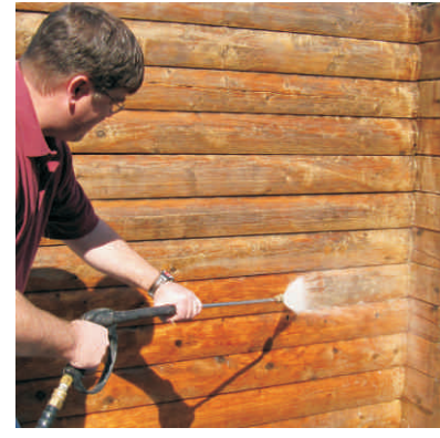
Step 7: Pressure wash starting at the bottom of the wall. Work on 2 or 3 courses of logs at a time. Hold the wand at a 30 to 45 degree angle to avoid feathering the wood.