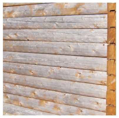
remove graved surface wood.