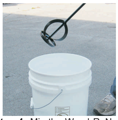
with the water using a paint minutes or until no undissolved solution to the wall with a mop. mixer and an electric drill.