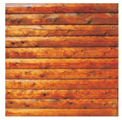
Step 9: Never judge the effectiveness of Wood ReNew or any other cleaner while the wood is still wet.