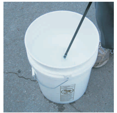
Step 4: Mix the Wood ReNew Step 5: Stir for about five Step 6: Apply the Wood ReNew granules are visible. Allow the broom or car wash brush. Start solution to thicken for 10 at the bottom of the wall and minutes before using.