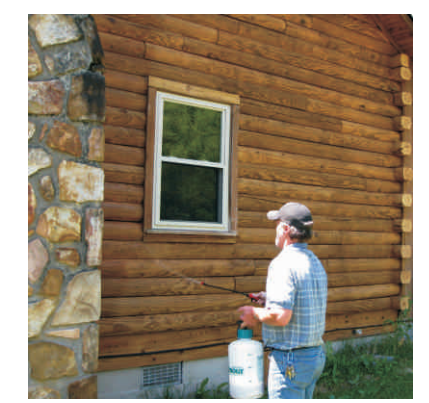
Step 1 : Add 1 gallon of water to Step 2 : Spray the surface with