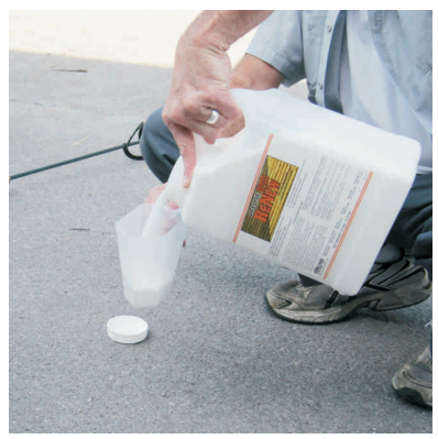
Step 1: Use Wood ReNew to Step 2: Only measure out Step 3: Pour the Wood ReNew enough Wood ReNew to add to into a pail that contains the a few gallons of water (0.8 cups water. Do not mix Wood ReNew per gallon) at a time. You need in a sprayer. to use whatever you mix up within 1 to 2 hours.