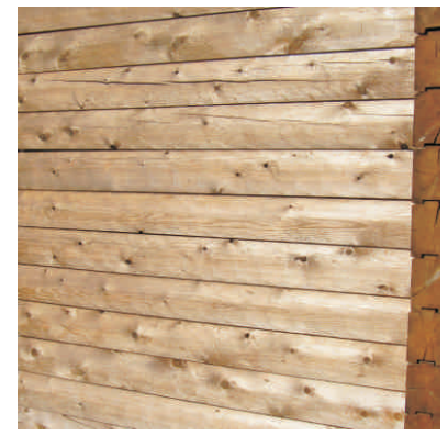
Step 10: Once the wood dries many of the dark discolorations will disappear. This is the same wall that appears in the previous step after drying for three hours.