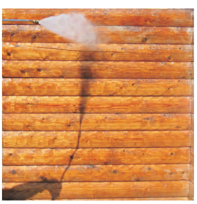
Step 8: Once the entire wall is pressure washed, rinse the wall starting at the top and work down. At this stage water volume is more important than pressure.