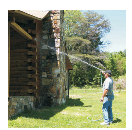
Step 3: If necessary, scrub the wall starting at the bottom and work up then rinse from the top