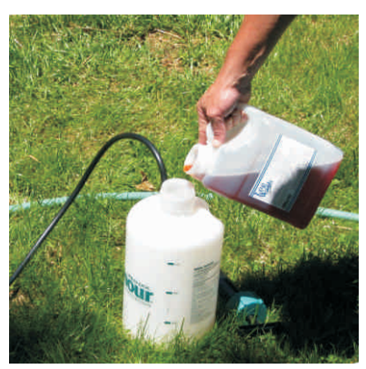
your sprayer then add the mixed Log Wash solution. approximately 2 cups of Log Start at the bottom and work up. Wash. If you add the Log Wash Allow 10 to 15 minutes contact down until you see no more first the sprayer will fill with time. Do not allow the surface to foam running down the wall. foam. Be sure solution is mixed. drv.