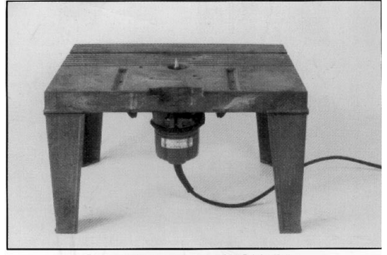
Precision sharpener available for "Original" disc