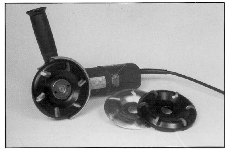
Carbide and steel wheel discs used to trim and shape hooves, woods and plastics.